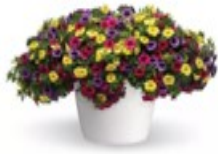
Gold and Bold