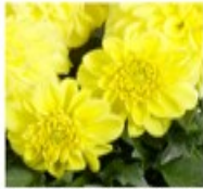
Mixed Dahlia Planter